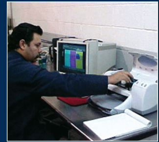
30,000 sq. ft. plant. State-of-the-art equipment.